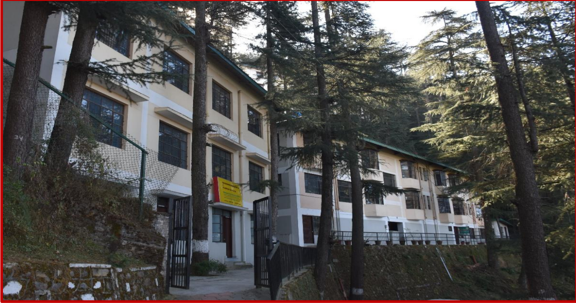
Photo of ICFRE-HFRI Rest House