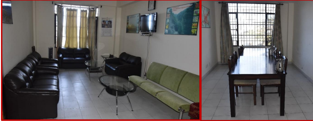
Photos of Rooms